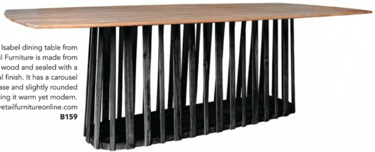
The Isabel dining table from Dovetail Furniture is made from teak wood and sealed with a natural finish. It has a carousel pedestal base and slightly rounded top, making it warm yet modern. www.dovetailfurnitureonline.com B159