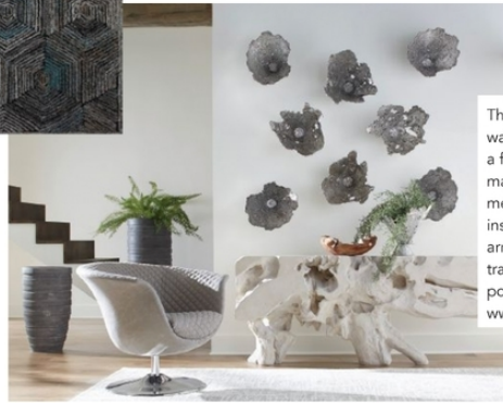
The Splash Bowl Jagged Silver wall art from Phillips Collection is a fluted decorative wall sculpture made of composite rather than metal. The sculpture is powerful installed in a gallery wall arrangement, and the intricate tracery on its surface makes it powerful when hung alone. www.phillipscollection.com A202