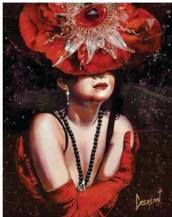
From Victor Fine Art, "All Eyes on Me," is available in 12-by-16-inch, 18-by-24-inch, and 36-by-48-inch sizes. www.victorfineart.com E2113