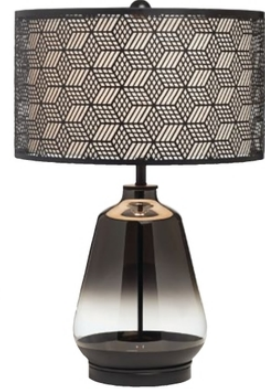
From Pacific Coast Lighting, the Taurus table lamp has a smoke black finish and metal and glass body. Outer shade: matte black metal drum shade. Inner shade: white polished linen drum shade. Measures 26 inches high. www.pacificcoastlighting.com A301