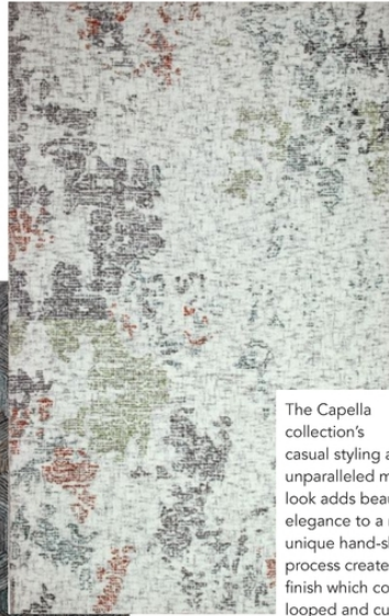
The Capella collection's casual styling and unparalleled modern look adds beauty and elegance to a room. A unique hand-shearing process creates a finish which consists of looped and cut pile. www.jauntyinc.com A455