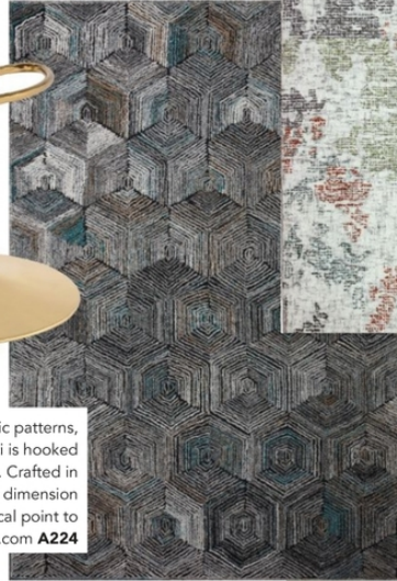
Featuring tone on tone geometric patterns, the Prescott Collection from Loloi is hooked of polyester, wool and viscose. Crafted in India, the high-low pile creates dimension and offers a unique textural focal point to any room. www.loloirugs.com A224