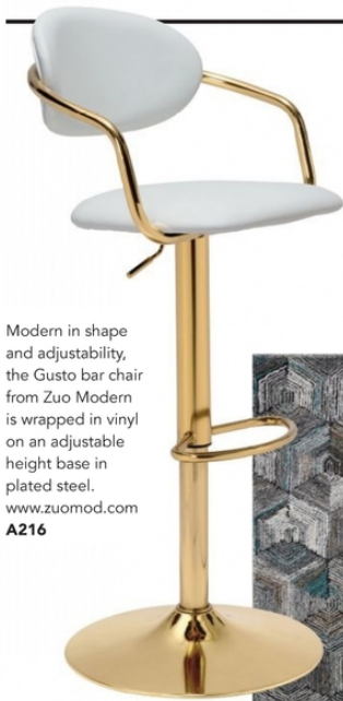
Modern in shape and adjustability, the Gusto bar chair from Zuo Modern is wrapped in vinyl on an adjustable height base in plated steel. www.zuomod.com A216